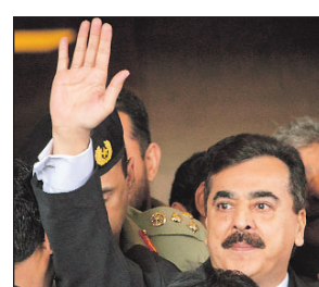
Pakistan PM Yousuf Raza Gilani in Islamabad.

Gilani, in a brief statement, said he did not comply with court orders on writing to