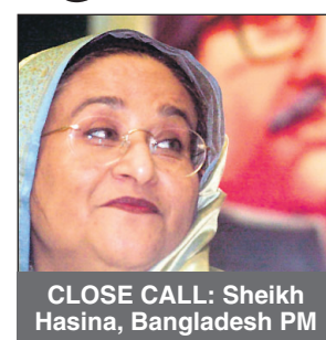
CLOSE CALL: Sheikh Hasina, Bangladesh PM

Sources in the army said the coup attempt was made late last month. "The attempt has been effectively controlled and now the process is on to punish the culprits," one military official said. The Prime Minister's Office and the Home Ministry did not comment, but addressing a rally outside Dhaka earlier this week, Hasina urged Bangladeshis to remain alert. — Reuters