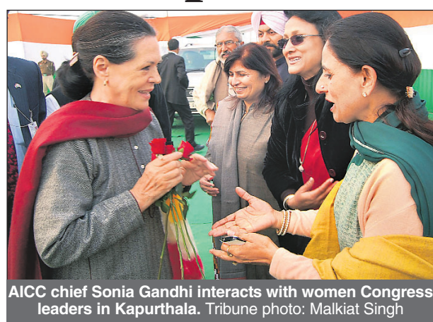
AICC chief Sonia Gandhi interacts with women Congress leaders in Kapurthala.

Starting her 15-minute speech with a salute to the holy town of Sultanpur Lodhi (a sub-division of Kapurthala district) where Guru Nanak Dev spent about 14 years of his life and attained enlightenment, Sonia Gandhi alleged the SAD-BJP government