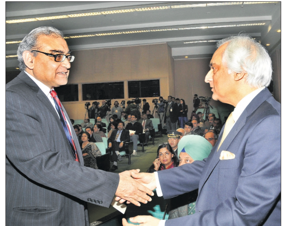
Pakistan High Commissioner Shahid Malik (R) meets the Press Council of India Chairman Markandey Katju at the function.